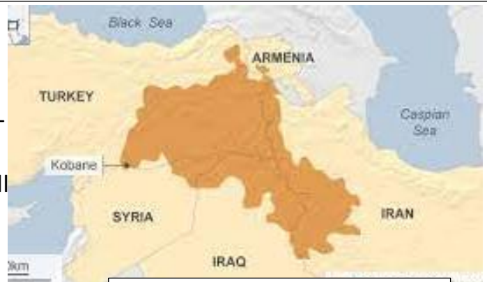
Where Kurdish people live in the Middle East.