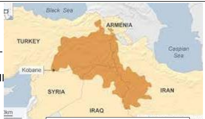
Where Kurdish people live in the Middle East.